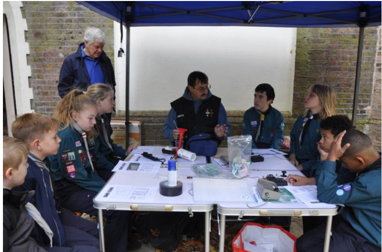
One of the many photos from Severndroog last year

We will have access from 8 am with the first Scouts coming through around 9am. We will then have a stream of Scouts all day until 6pm.